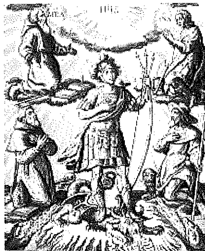
DEATH AND DELIVERANCE FROM PLAGUE A woodcut illustration depicting the death and deliverance from plague. The central figure is a man in a long, patterned robe, likely a saint or a person of high status, who is shown in a state of suffering or death. He is surrounded by other figures, some of whom appear to be in distress or mourning. The scene is set in a room with architectural details like columns and a doorway. The overall tone is somber and dramatic.

Almighty God, do not disdain your people who cry to you in their affliction, but for the glory of your name be pleased to help us who are so sorely troubled. Show us, O Lord, your inexpressible mercy and blot out our transgressions.